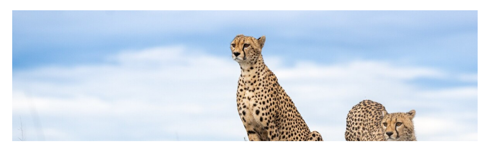
DAY 10 SATURDAY · AUGUST 16, 2025