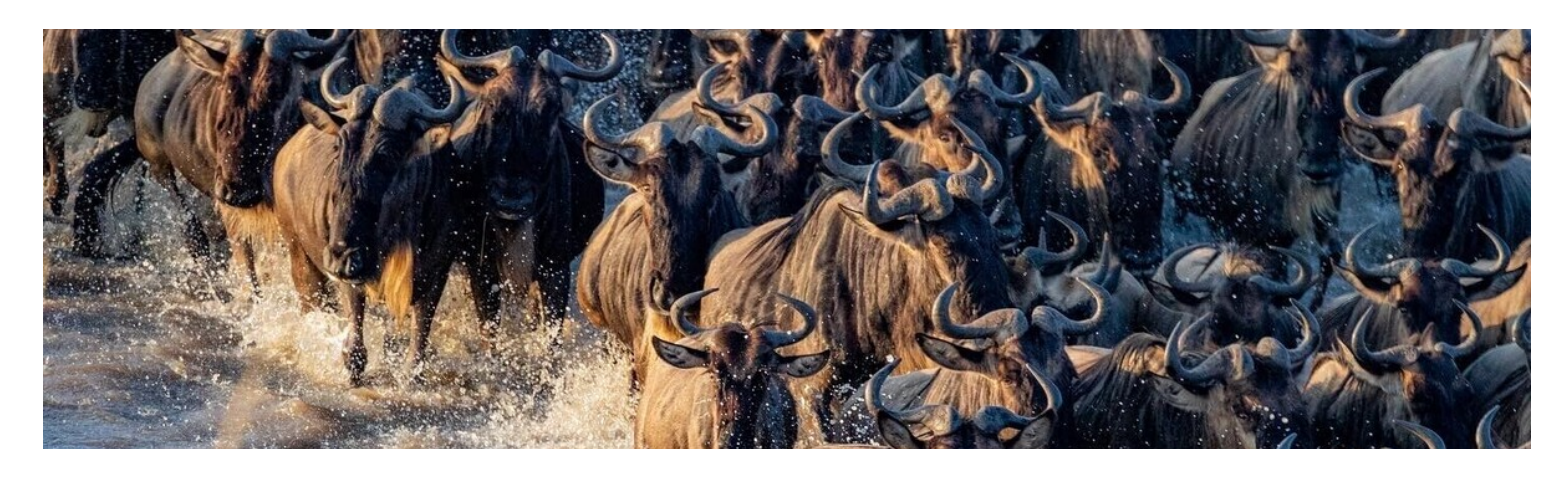
DAY 11 SUNDAY • AUGUST 17, 2025