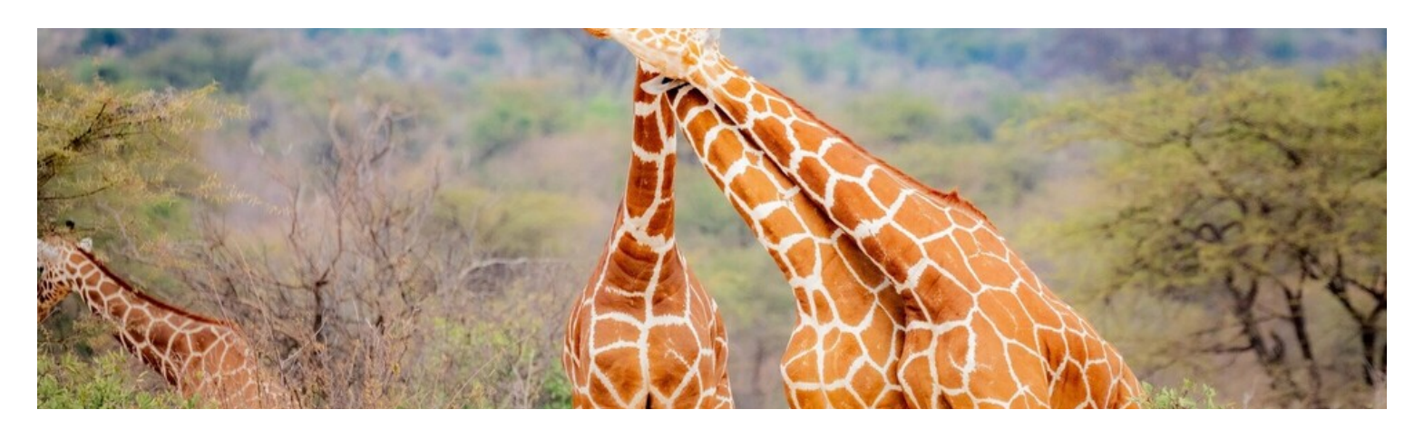
DAY 7 WEDNESDAY · AUGUST 13, 2025