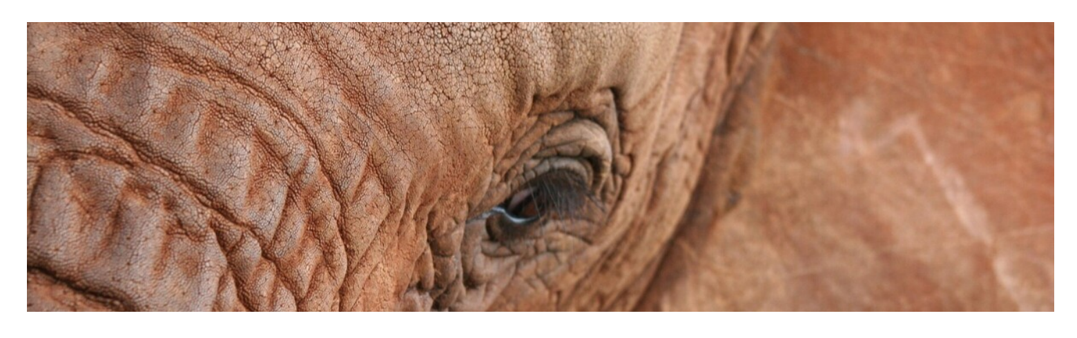
DAY 2 FRIDAY · AUGUST 8, 2025