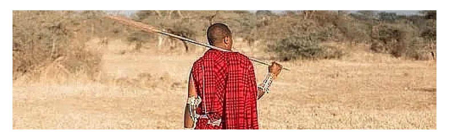
DAY 4 - 5 SUNDAY - MONDAY · AUGUST 10 - 11, 2025