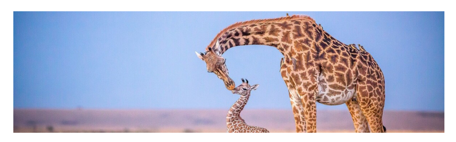
DAY 9 FRIDAY · AUGUST 15, 2025