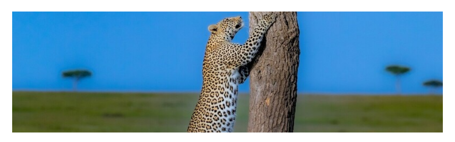
DAY 12 MONDAY • AUGUST 18, 2025