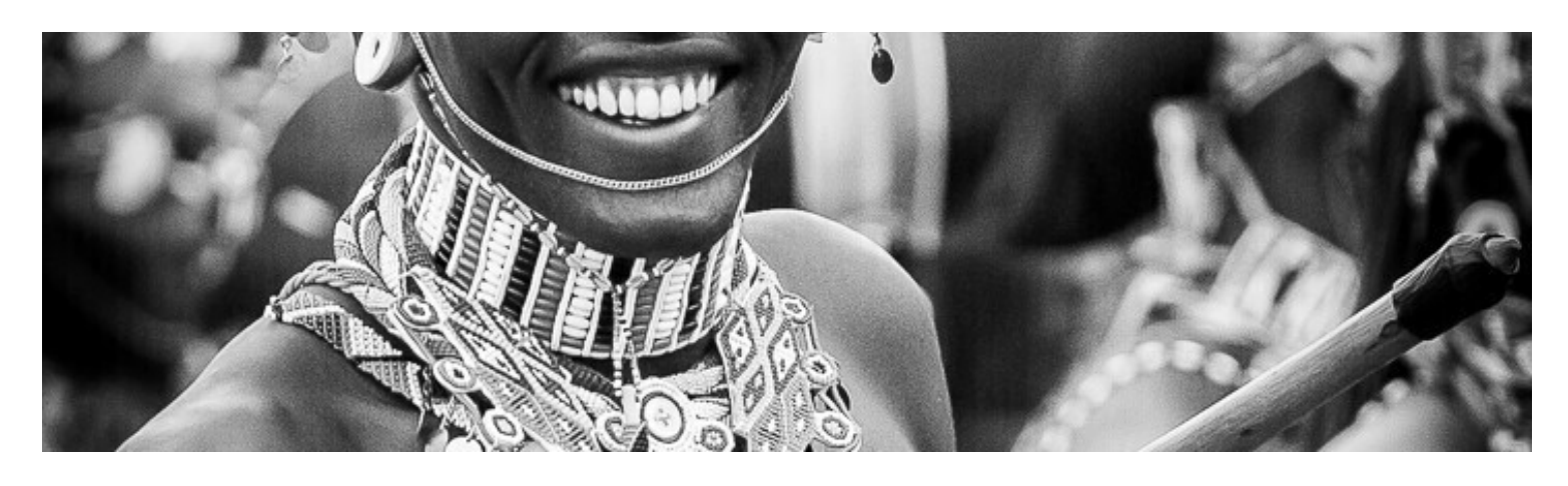
DAY 6 TUESDAY • AUGUST 12, 2025