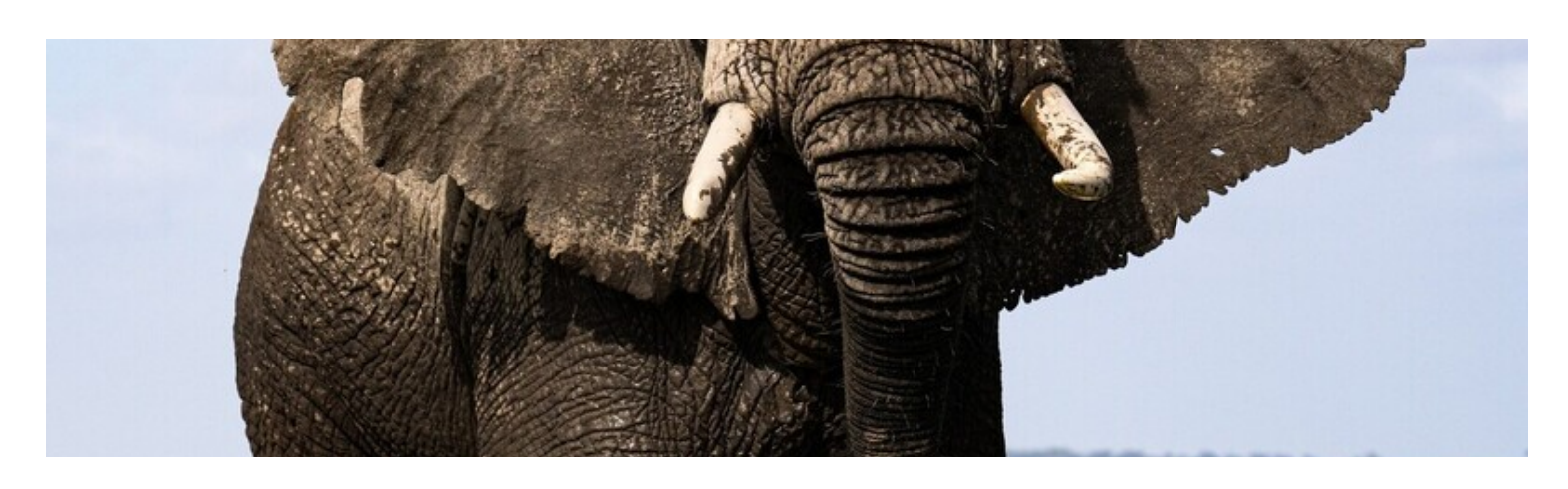
DAY 3 SATURDAY · AUGUST 9, 2025