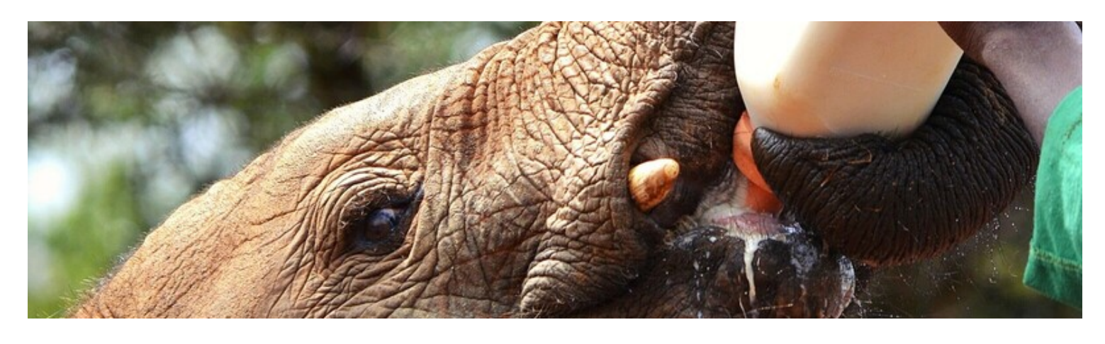
DAY 1 THURSDAY · AUGUST 7, 2025