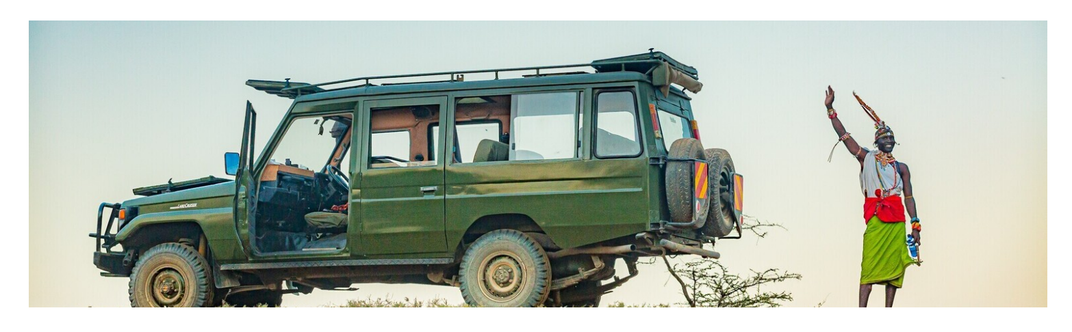
DAY 8 THURSDAY · AUGUST 14, 2025