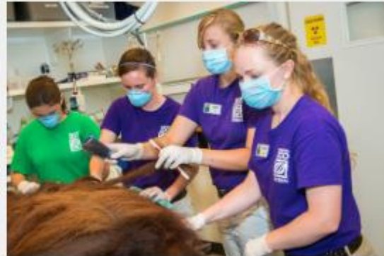
NEW Vet Camp