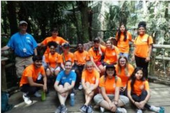
All Access at the Zoo